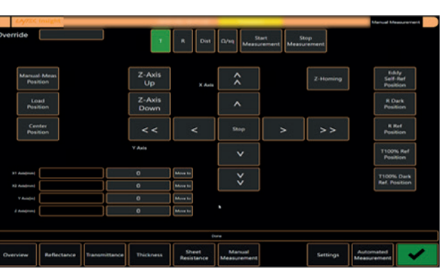
Fig. 3 Views of the ILMetro R2R software GUI. Left: View for reflectance data displaying the current spectrum as well as a corresponding distribution map and SPC chart. Similar views are provided for each method. Right: View for winder control.