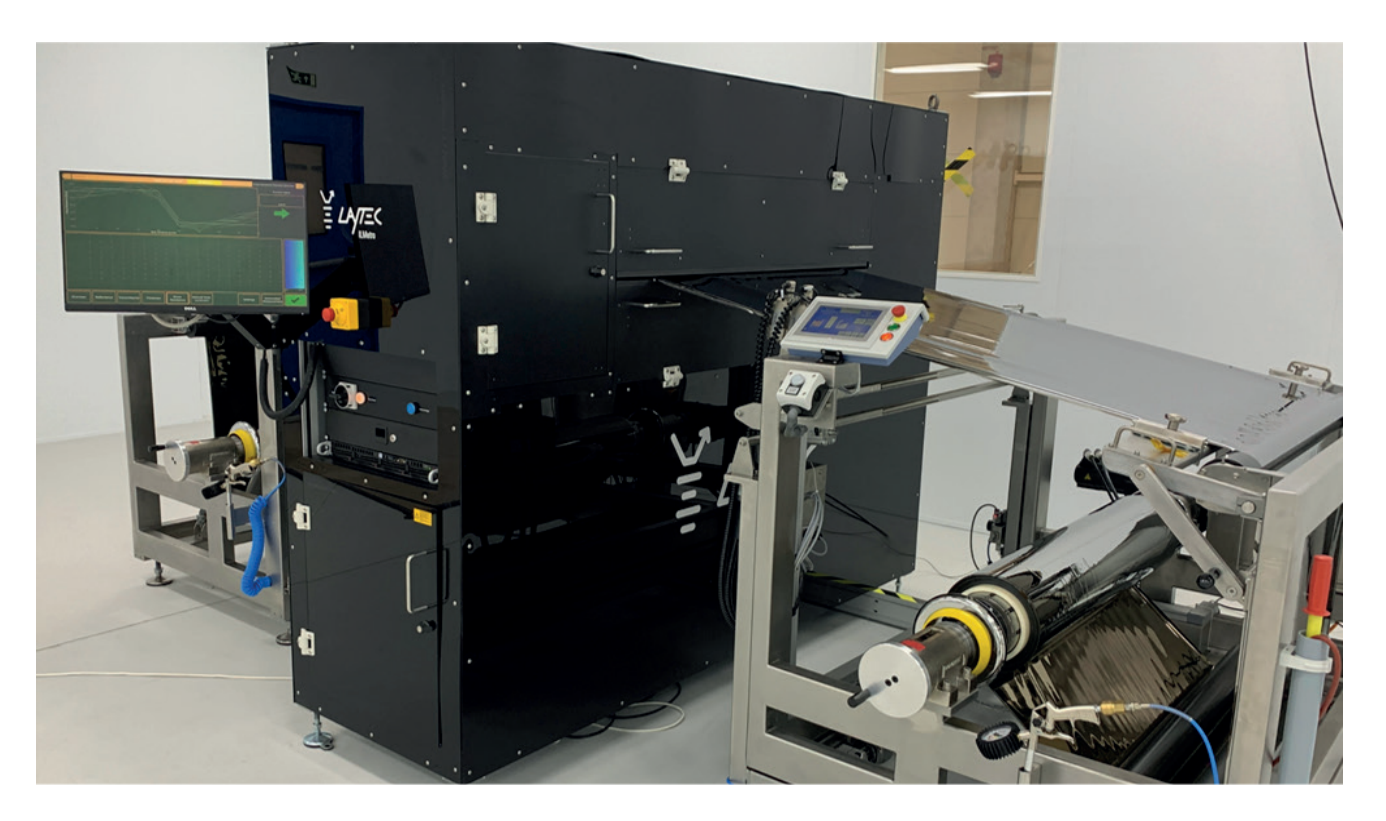
Fig. 1 ILMetro R2R metrology system as recently installed by a leading manufacturer of flexible photovoltaic modules. Here the system is directly integrated into a winder system for transporting the foil to the appropriate measurement positions for quality control purposes.

successfully commissioned at a leading manufacturer of flexible photovoltaic modules. It controls a winder system at high precision for positioning the foil underneath the measurement head and characterizes all critical layers of the film stack for a self-sufficient, comprehensive quality control of the layer properties.