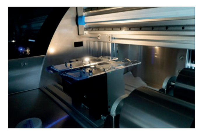
Fig. 2: Separate sample compartment for the manual characterization for small-scale R&D samples.

Depending on the requirements of the production process for a particular thin film device, ILMetro R2R can be equipped with a combination of any of the following metrology methods: